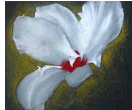
Cyclamen Blossoms from the Polly Thayer Starr Charitable Trust Collection

In winter she drew white cyclamen blossoms, whose pristine recurved petals were sometimes splashed with red at the heart. In summer she delved into irises and zinnias that bloomed in her garden. The graphite and charcoal of her early training gave way to rich pastels. Some flowers were fully formed and lavish, with pale brown throats and bees and vibrant backgrounds, and some were almost abstract in the simplicity of their lines and planes.