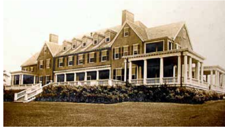
The original Thayer summer home, which burned down in 1929. This is where Polly grew up.

During my childhood the only threat of fire was from the magnificent thunderstorms that took our hilltop with full fury in the summer. The best vantage point for nature's pyrotechnic displays was the balcony of Mother's room over the