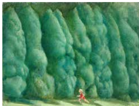
Distances Private Collection

If it was rainy we played in the vast penumbra of the hayloft with the tidy little barn swallows twittering and skimming about us in the rafters. There was no end to the variety of engrossing activities that farm life provided for a child. The ritual of the ducks emerging from the duck-house to waddle in single file down the hill and launch into the river in the morning, returning in formation as punctually at dusk, was one I hated to miss.