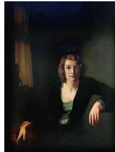
Interval, self-portrait, 1930 Museum of Fine Arts