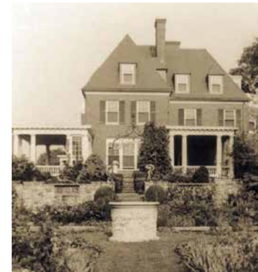
The re-built Thayer summer home in a photo taken around 1933. It is now the Pat Roche Hospice Home.

The room ticked and tinkled with the hours. Mother had eleven time-pieces in her room, all synchronized as exactly as human agency permitted in the days when clocks were still wound by hand. They were of every size, shape, and nationality, from an elegant little French clock no more than ten inches high with