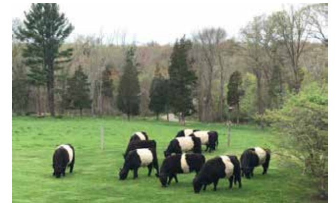
A recent photo of cows in the same field