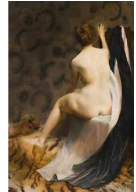
Circles New Britain Museum of American Art