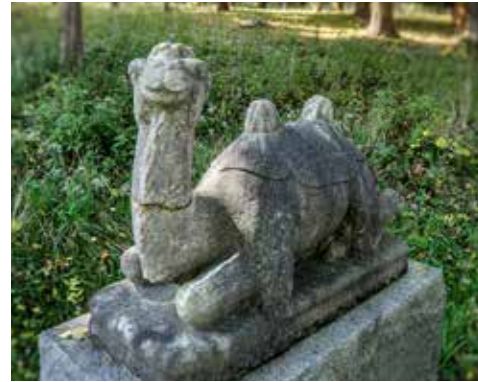
One of the Camel Statues

1962 The first residents moved in to their new home on Turkey Hill. Residency was not restricted to Quakers.