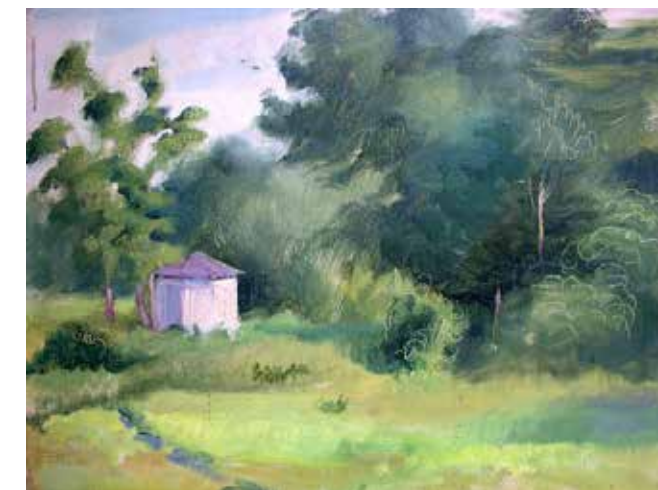
House in the Woods Polly Thayer Starr Charitable Trust Collection

My retreat was outdoors on top of an arbor at the end of a garden. It was bliss to lie in a murmurous bed of white clematis tremulous with bees, buzzing ecstatically as they do when hard at work in the full sunlight, with the protective grace of a blue sky above them.