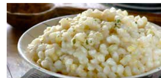
A bowl of samp

like popped corn without husks and boiled in butter, and the mere thought of lobscouse makes my mouth water. It was the simplest of dishes, and I have a dim idea it was of seagoing origin and, considering its name, perhaps Scandinavian. It consisted of thin layers of buttered baked pilot biscuit, fragile and soggy at the same time. And there were such delicious desserts: buttered toast drowned in molasses and caramelized by baking, brown-skinned rice puddings, and bread puddings with surprise layers of our own wild grape jelly, topped with meringue. I wonder if time has glamorized these sensations of taste that remain in my memory as so uniquely delicious.