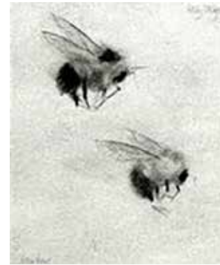
Sketch of Bees Polly Thayer Starr Charitable Trust Collection

Around this period Thayer was given a jeweler's loupe. "It was a watershed," she recalled in a talk in 1997. "As a child I had been shown how to pat bees. It was always a thrill for me, and, to judge by the purr-like vibrations the stroking generated, for the bees as well. But I had no idea of the bronze wings' beaded hinges imbedded in the delicious fur jacket, or the jewelry of their articulation, until I studied them under the loupe's magnification."