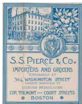
S.S. Pierce & Co. Label

Each week the "S.S. Pierce Man" (pronounced purse by Bostonians) arrived in horse and buggy and derby hat to submit a list for mother to check off items we could not produce ourselves, such as fresh and dried fruits, and brandied cherries whose equal I have never tasted since. We always watched eagerly for his appearance.