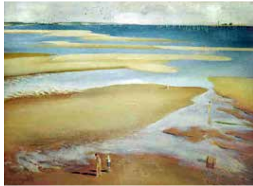
Wandering the Salt Flats Provincetown, c. 1960 Private Collection