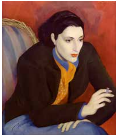
May Sarton Harvard Art Museum

“There’s a French saying ~ tout dire, c’est ennuyer. If you are saying everything, you are a bore. Things that you see aren’t sharp against each other, they’re blurred. You only sharpen the ones that you want to look at... If you want to make a statement, then you need to focus on some one point in it. I began to understand the importance of that. ”