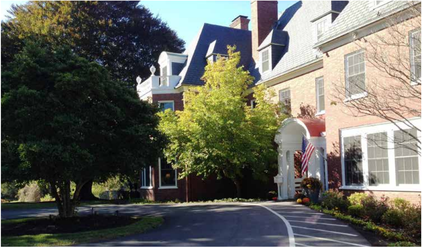
The Pat Roche Hospice Home 86 Turkey Hill Lane, Hingham