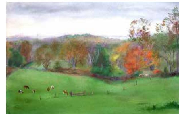
Cows in Field Polly Thayer Starr Charitable Trust Collection

2013 On October 17, 2013 the Pat Roche Hospice Home on Turkey Hill opened to serve the community as the only non-profit residential hospice care facility on the South Shore. ■