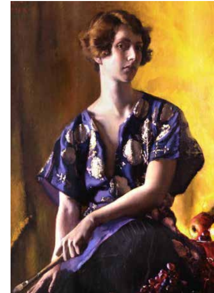
The Algerian Tunic an acclaimed self-portrait, c. 1927 Private Collection