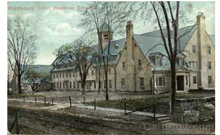
The Westover Boarding School

"It did not commend itself to me, when I got to thinking about it, that I should turn off processes that seemed to me important, such as the intellectual or the thoughtful... My difficulty from the start was to put