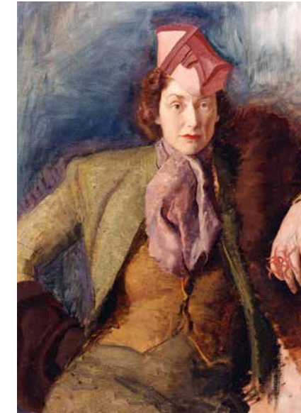
Self Portrait with Fur, c. 1943 From the collection of the Boston Athenaeum