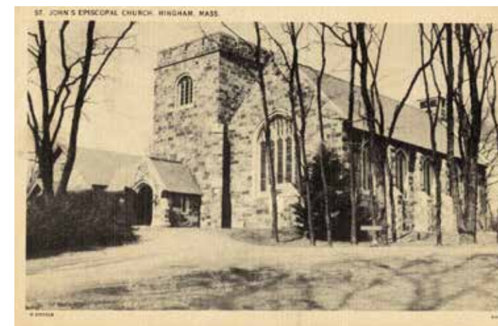
St. John's Episcopal Church in Hingham from a postcard printed in 1949

Every summer Mother played hostess to a carefully planned sequence of old friends and people she felt might benefit from a weekend in the country. Between guests, her days were simple. She carried on a voluminous correspondence, oversaw the care of the trees and the gardens, and put much time and love into the rebuilding of St. John's Church, in Hingham in Father's name. It is well worth a trip for the very handsome stained glass windows in the chancel as well as the creatures carved in the pew ends which were copied from an English church where they had struck my Mother's fancy.