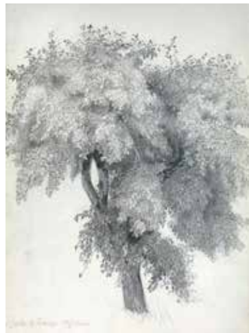
Wineglass Elm

The sole casualty of the early plantings has seemed to be the wineglass elm at the front door, mortally wounded we believed by the fire that razed the house twenty years later. But it recovered from the disaster to live for almost another half-century, succumbing finally to Dutch elm disease. Year by year we watched the decimation of the elms that formed an archway along the avenue from East Street. They figure poignantly in my memories of those days, and even, I think, in the paintings I later did of tree-sheltered houses. Frances Cornford in August at Home expressed something of my feeling for them: